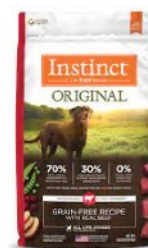
Instinct Original Kibble