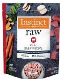
Instinct Frozen Raw Bites

The Instinct Raw Bites are frozen and must be de-thawed before feeding. I usually defrost the puppy food in a ceramic bowl in the microwave. I have found that all protein varieties of the frozen food are of equal value. This product can be ordered on chewy.com or purchased at Petco and Petsmart. As an alternative, the Raw Boost Kibble is easily available at Petco and Petsmart as well. The Original formula is the same as the Boost kibble, it just does not contain the dehydrated pieces, but has a more budget friendly price point. It is not available in stores, but can be purchased online. This is what we transition all our adult dogs onto and have on autoship.