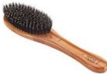
BASS BRISTLE BRUSH