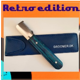
GROOMER DK RETRO KNIVES