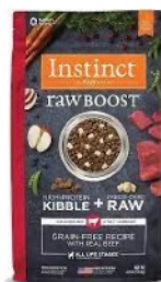
Instinct Raw Boost Kibble + Dehydrated Raw